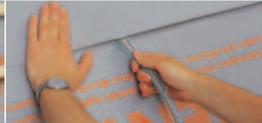
Product identification markings serve as a guide for overlap edge.