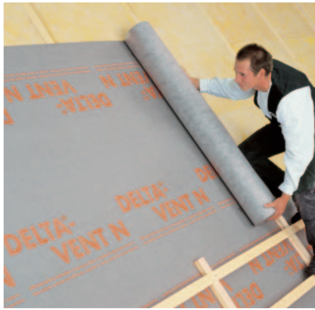
DELTA®-VENT N, the 3-ply composite, provides for secure and fast installation.

DELTA®-VENT N PLUS with the integrated self-adhesive border provides a faster windtight installation.