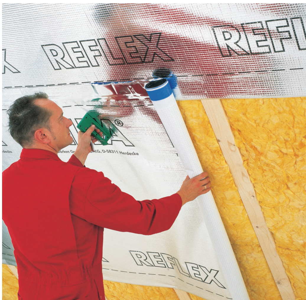
DELTA®-REFLEX – the universal vapour barrier sheet.