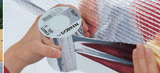
DELTA®-REFLEX PLUS with integrated self-adhesive border.