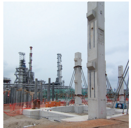
HALFEN HZA DYNAGRIP Channels cast vertically in columns to connect further components.

Hot-rolled, serrated HALFEN HZA DYNAGRIP Cast-in channels were selected here as they met the multi-directional, dynamic and seismic load requirements. In addition, the channels also met the fire and corrosion protection required by the project.