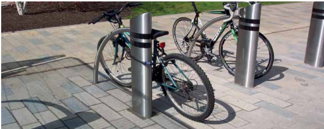
>> Security with useful benefits - TRUCKSTOPPER with bicycle rack