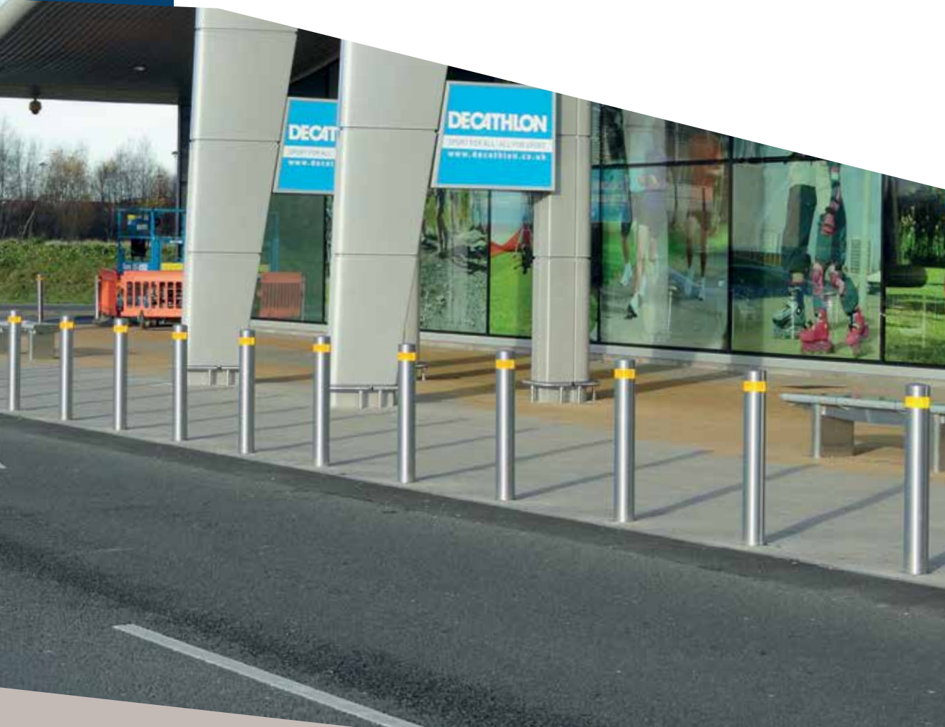
>> CARSTOPPER 30 with high quality stainless steel shroud