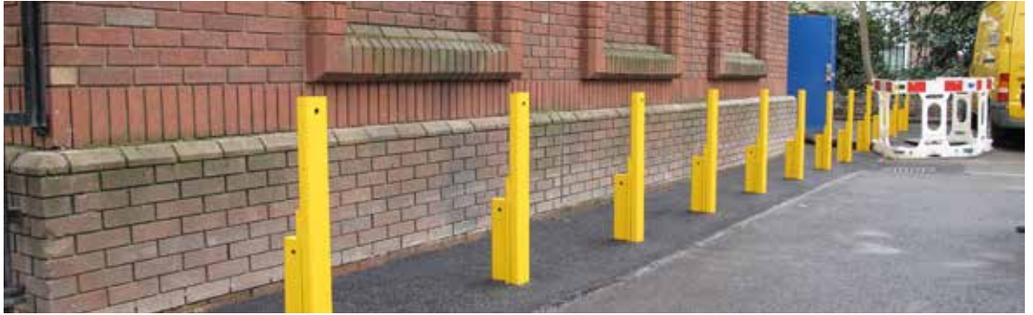
>> TRUCKSTOPPER 6 without shroud