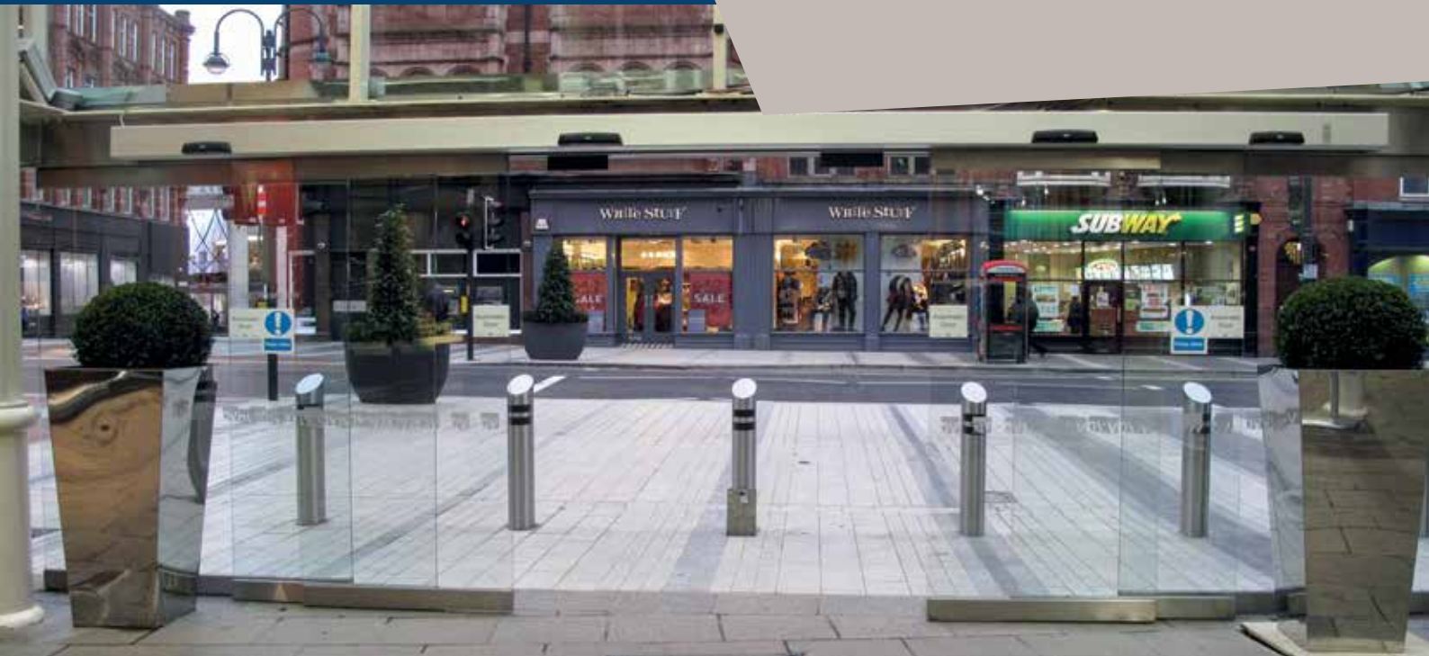
>> Effective protection of inner-city areas in modern optics with TRUCKSTOPPER 6/7