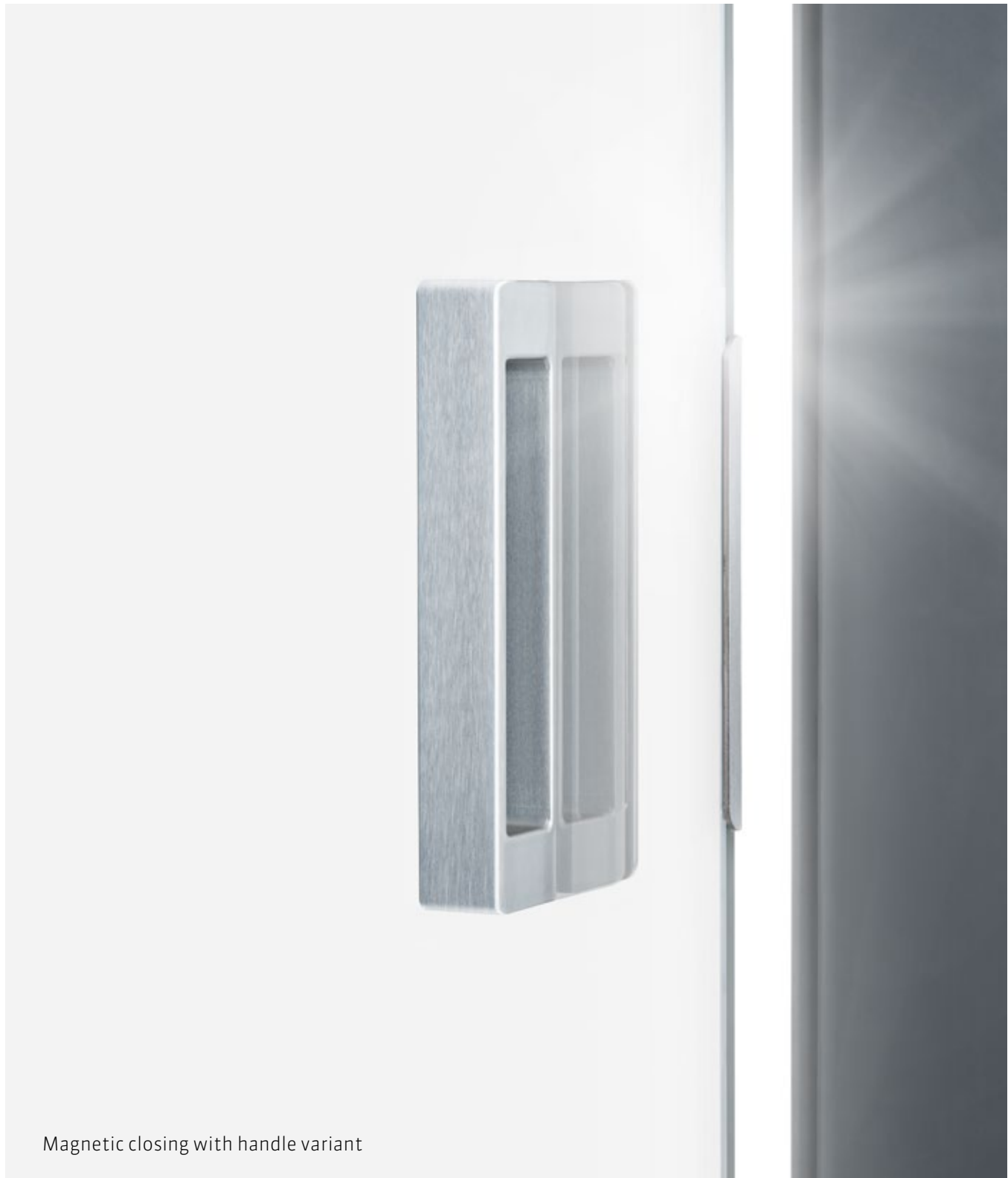
Magnetic closing with handle variant