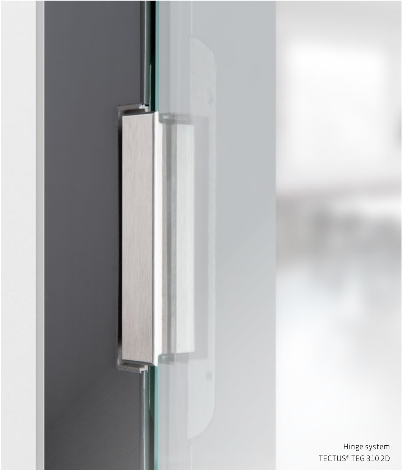
Hinge system TECTUS® TEG 310 2D